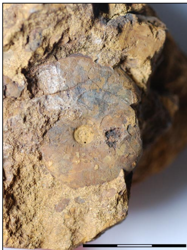
Figure 7. Leioceras sp., showing external ornament; Northampton Sand Formation, Hungerton Pit (BGS #Zm9530; collected by P.E. Kent, 1966). Bar scale is 3 cm long.

In the Northampton Sand Formation, fossils are localised but may be abundant; “... they include numerous bivalves, brachiopods, notably Lobothyris trilineata .... and rare ammonites, including several specimens of Leioceras opalinum found at Harlaxton near Grantham...” (Kent, 1980, 47). This reference to ammonites concerns two specimens collected from the upper part of the formation in the Hungerton quarry, one by Kent and the second by the writer. Both specimens