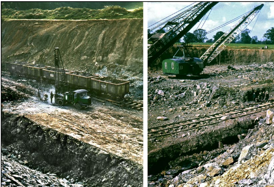
Figure 2. Two views of Denton Park Pit in 1966, with the Marlstone Rock Formation overlain by the Whitby Mudstone Formation