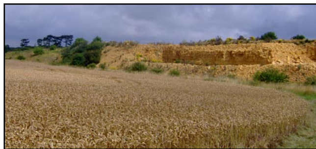
Figure 5. The Saltby Pit site in 2008, looking northeast across the former worked area, with Lincolnshire Limestone exposed in what was the overburden face.

1971 a section at [857262] exposed Northampton Sand (c.2.5 m seen), Grantham Formation (5.05 m) and Lincolnshire Limestone (6.0 m seen) (Kent, 1975). An exposure of the Lincolnshire Limestone remained in 2008 (Fig. 5).