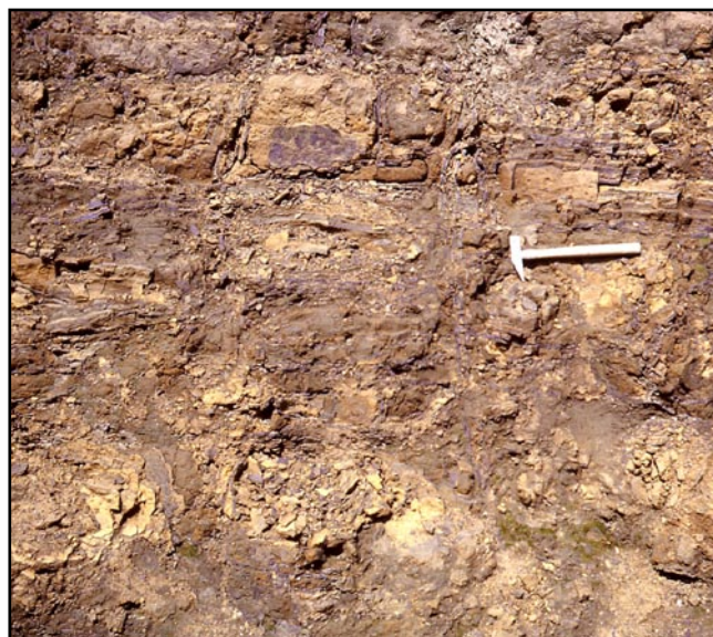
Figure 3. ‘Boxstone’ structure in the Northampton Sand Formation exposed at Hungerton Pit in 1966.

This was one of the Harlaxton group of workings and was known as Harlaxton No. 4 (Hungerton) quarry [883305 to 889309] (Tonks, 1991). In 1966, it was worked by Stewarts & Lloyds Minerals Ltd in a face that extended WSW-ENE for some 800 m. The quarry exposed Northampton Sand (c.6 m) overlain successively by the Grantham Formation (formerly the Lower Estuarine Series, c.5 m) and the Lincolnshire Limestone Formation. The Whitby Mudstone Formation was visible locally beneath the Northampton Sand (Stevenson, 1964).