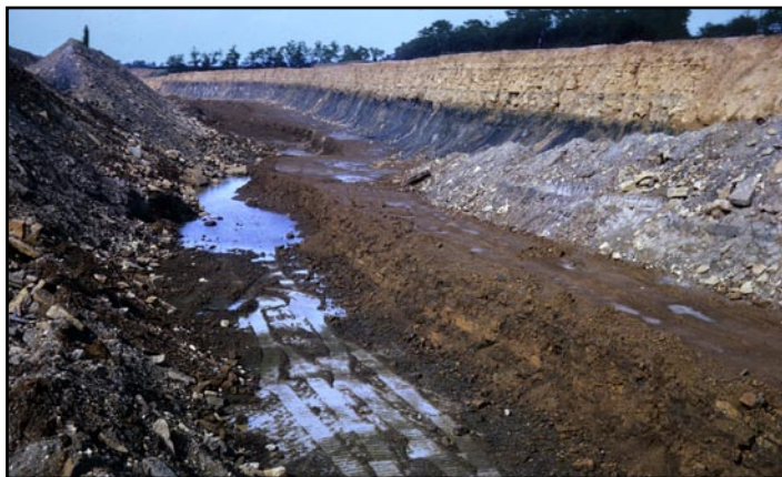
Figure 4. Two views of Saltby Pit in 1966, with Northampton Sand Formation overlain successively by the Grantham Formation and the Lincolnshire Limestone.

In 1966 this quarry [857263 to 860255] comprised a face c.1 km long that was being worked eastwards, down-dip, towards the west side of Saltby airfield. The workings exposed the upper 2.4 m of the Northampton Sand, overlain successively by the Grantham Formation and the Lincolnshire Limestone (Fig. 4), the latter more massive than at Hungerton, some 5 km to the NE. The Northampton Sand appeared as at Hungerton, with a shell bed present at the top. The Grantham Formation comprised grey to silver, silky-textured, silty mudstones and silty sandstones, and darker grey mudstones. In