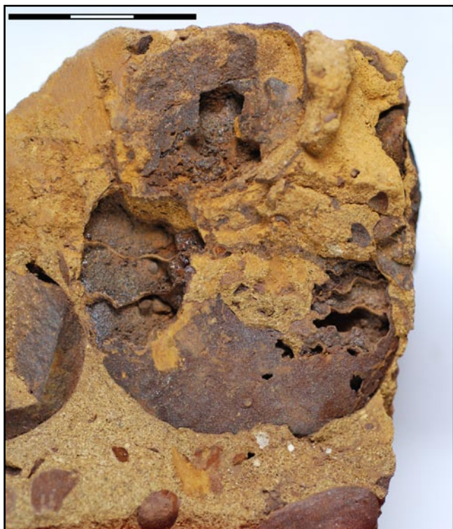
Figure 8. Leioceras sp., showing internal structure and septa; Northampton Sand Formation, Hungerton Pit (BGS # Zm9530a; collected by G. Warrington, 1966). Bar scale is 3 cm long.

are in the British Geological Survey collections at Keyworth, and are registered as Zm9530 and Zm9530a respectively.